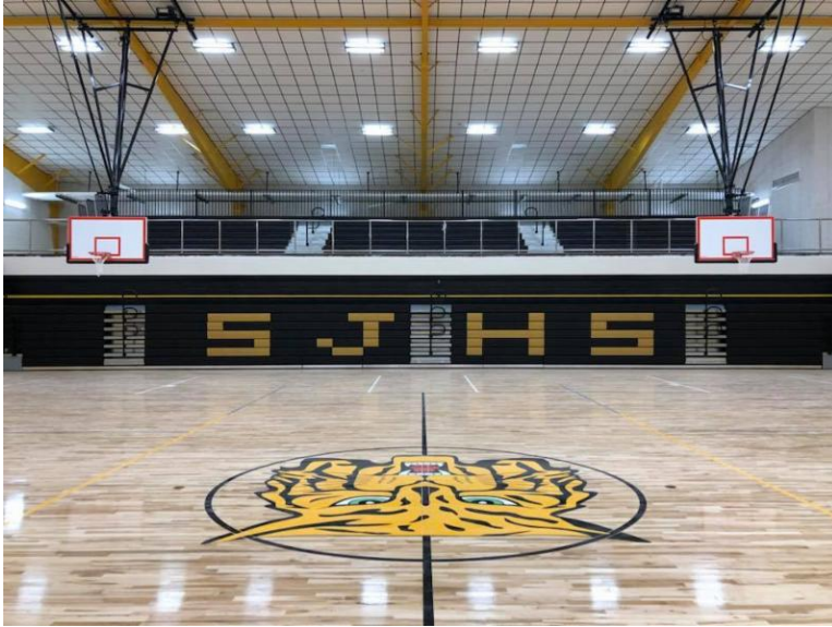
St. James High - HEI installed Sheridan bleachers on the main floor and balcony

These are just a few highlights - we hope you're following us on Facebook and Instagram for timely updates on all of our projects!